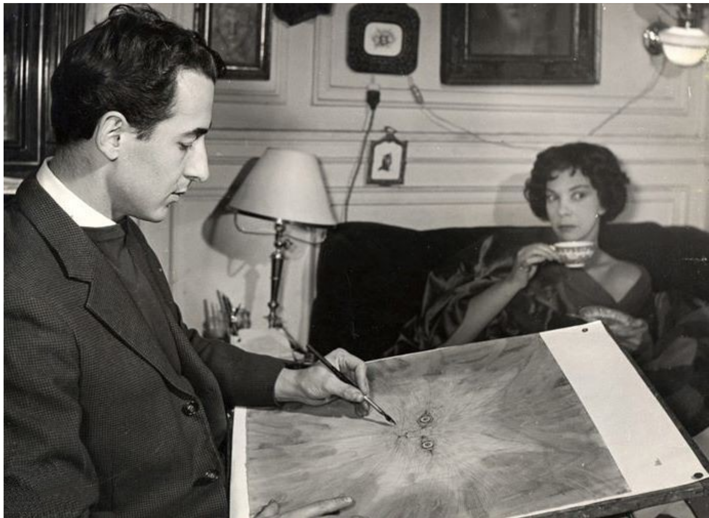
Colombotto Rosso e Leonor Fini