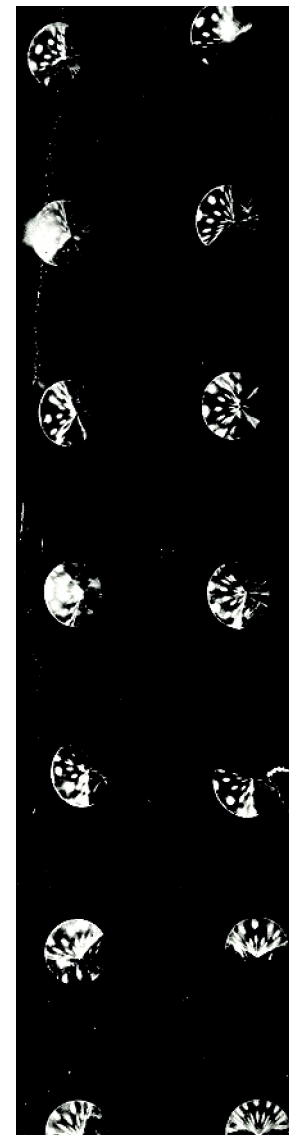
Particolare di "Diamant"